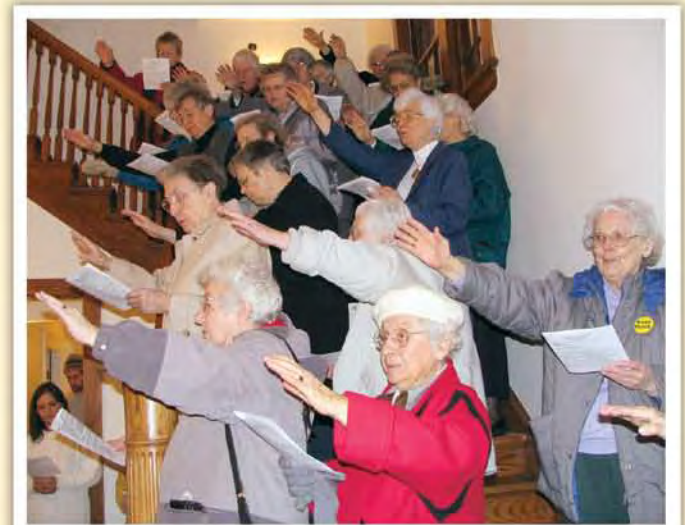
The Sisters bless the renovation and its future occupants.

The Sisters then toured the building—its three floors of apartments and the basement which will house offices and a meeting room. The transformation from the building they had known to modern efficiency apartments amazed and delighted them. Nonetheless, they searched for familiar items such as the stained glass windows which indicated the former location of the chapel, the fireplace the location of the recreation room, and window locations to indicate former bedrooms.