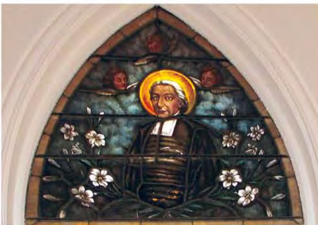
This stained glass window portraying St. John Baptist de La Salle, patron of Christian teachers, was originally part of the house's chapel, which has now become an apartment.