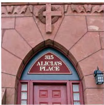
The former Cathedral / Sacred Heart Convent—now Alicia's Place