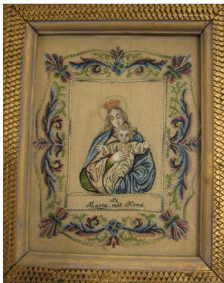
The needlework samplers.