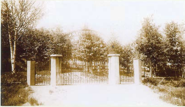
These gates were installed in 1912; a handwritten, undated, unsigned note on the back of this archival photo says "Iron gates given to scrap iron drive in WWI." However, 1930s-era pictures show the small side gates still in place.