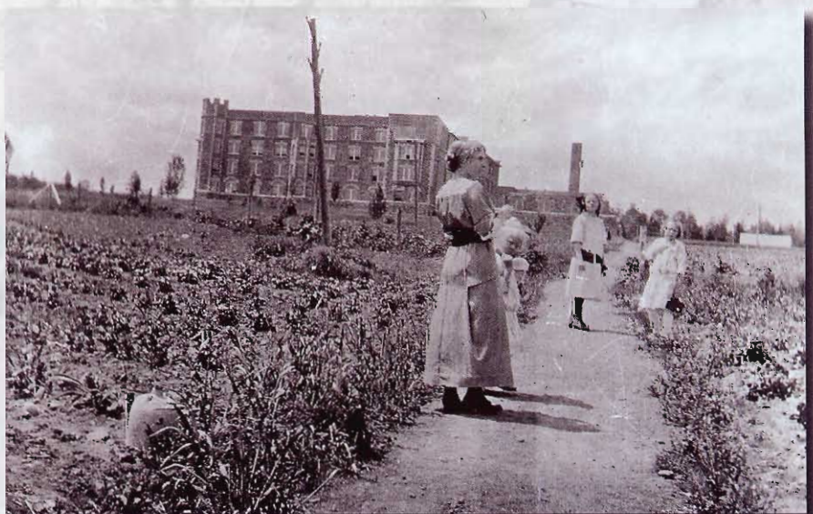
A view of the 1909 building from what is now the campus segment of College Street. The laundry-boiler room-science lab building is visible in the rear.

Peter took Mother Scholastica to the offices of the St. Paul Building Inspector. The Inspector assigned a young consulting engineer, Franklin Ellerbe, to the project. Ellerbe travelled to the site, spent a day looking over the building, and within a few days had recommended to the Sisters that the contractors should be terminated. The architects went with them, "tearing up their plans and specifications" as they left. Mother Agnes Somers in her unpublished history of the Community is kind in her analysis of the contractors: "They seem to have been honest men but lacking in experience." In later years in Community lore, the deficiencies in construction have sometimes been attributed to deliberate anti-Catholic bias, but this is probably not the case.