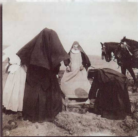
Below: Instant trees! The Sisters dug the holes, and the workmen brought in the transplanted pines by horse and cart.