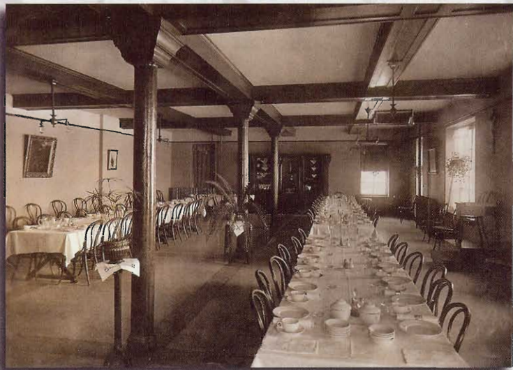
Left: The students' dining room showing the pillars and enclosed beams added to strengthen the building.

Franklin Ellerbe took over the reconstruction project. As Mother Agnes reports, “walls were thickened and reinforced with steel bands. All of the large rooms were further strengthened by iron pillars. . . steel rods were strung below the ceiling in all rooms except those on fourth floor. . . covered with weathered oak,” which gave an English Tudor flavor to the interiors. The building was completed in August 1909.